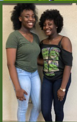
Camp Anytown Participants