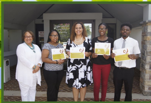
Yardi Scholarship Recipients