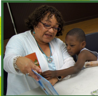
Reading is My Superpower