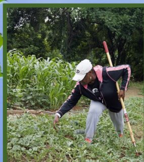
Senior Garden at Hall Towers