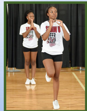
Cheerleading Camp– Shaw University