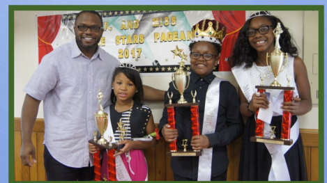
Mr. and Mrs. Future Stars Pageant