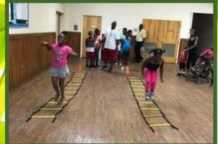
Summer Fit Program