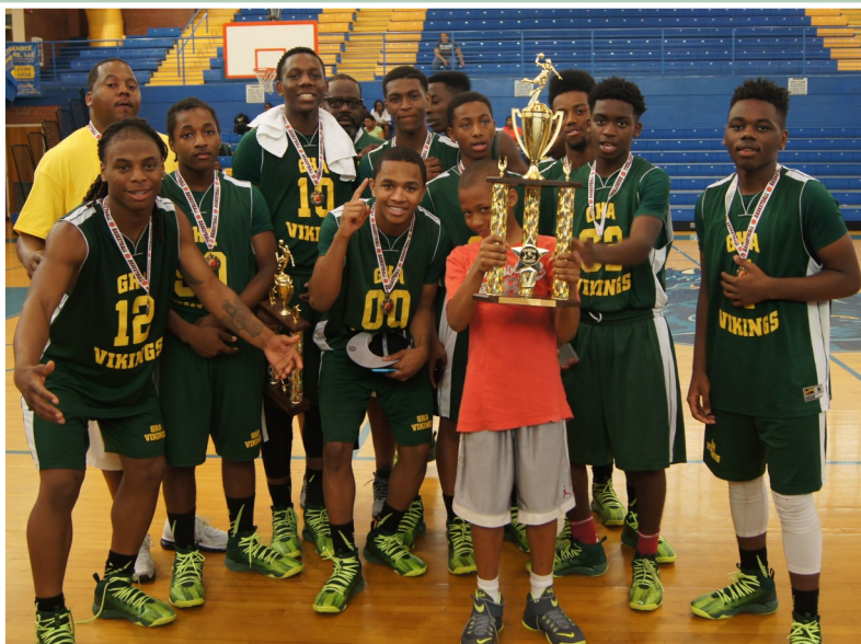
GHA Vikings - 2015 PHASAC Champions

opportunity to play organized sports and promotes education through Saturday workshops and tutoring throughout the season. The tournament’s goals are to promote a positive lifestyle, raise self-esteem, expose youth to a college environment, provide a positive venue to interact with law enforcement, and engage in healthy positive athletic competition for all participants.