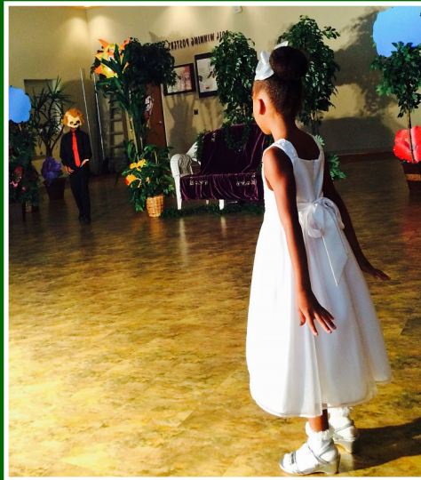
A scene from the 2014 production of Mixed-Up Fairy Tales