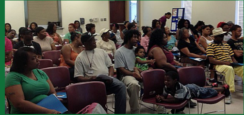
Hampton Homes residents attend a RAD information meeting held in June.

This is part of a series of articles to keep you informed about Greensboro Housing Authority's progress in converting our public housing communities to Rental Assistance Demonstration (RAD) housing.